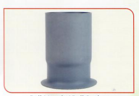
Bell Mouth / Bell Socket 50mm - 75mm - 90mm - 110mm 160mm - 200mm - 250mm