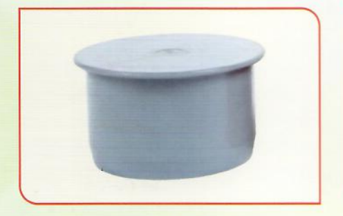
End Socket Plug 50mm - 75mm - 110mm - 160mm