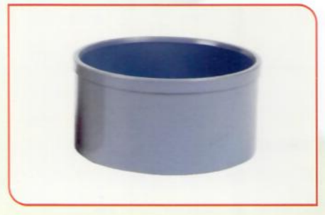
End Cap 50mm - 75mm - 110mm - 160mm