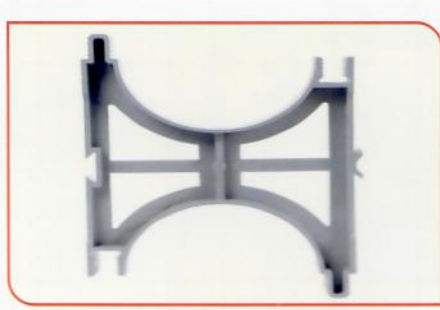
Intermediate Spacer 110mm - 160mm