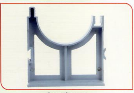
Base Spacer 110mm - 160mm