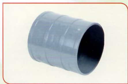
Coupler / Socket 50mm - 75mm - 110mm - 160mm - 200mm